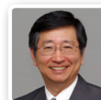
Koji Tsuruoka Representative of the Government of Japan Ambassador Chief Negotiator for the TPP